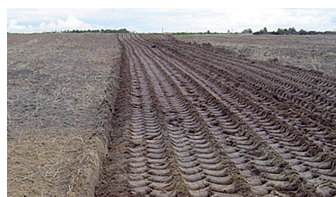
Tyre roller ensures better groundwater management