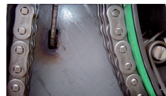
Extra-heavy drive chain