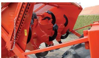
Specially designed spader blades