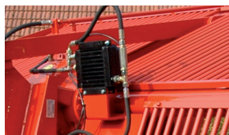
Option: Oil cooler to cool oil in transmission case